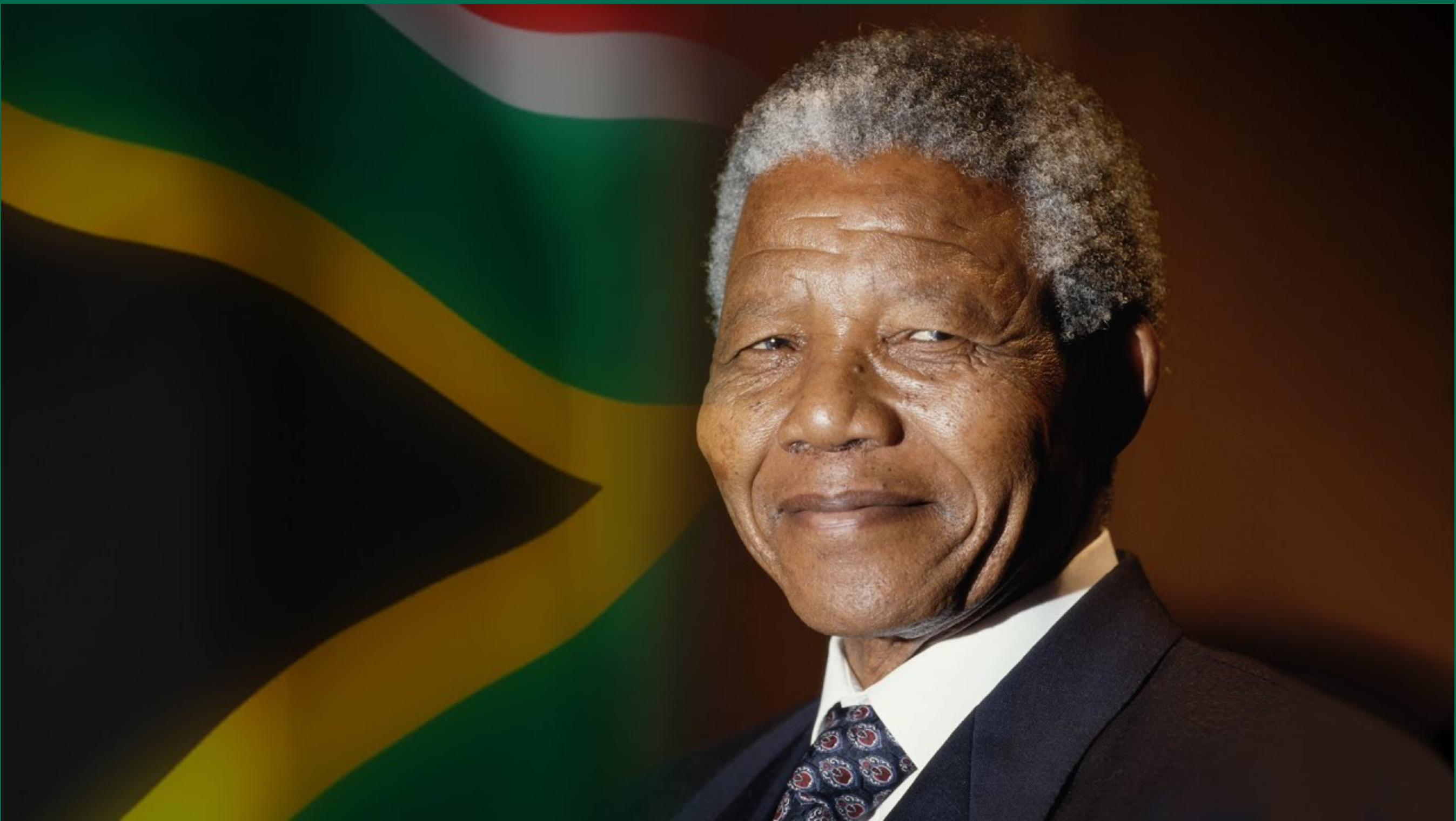
This is Nelson Mandela, a human rights advocate after which the Mandela Rules were named. He was South Africa’s First President elected from a democratic election. An avid activist, his policies got him into trouble with the law, and he spent many years of his life imprisoned.