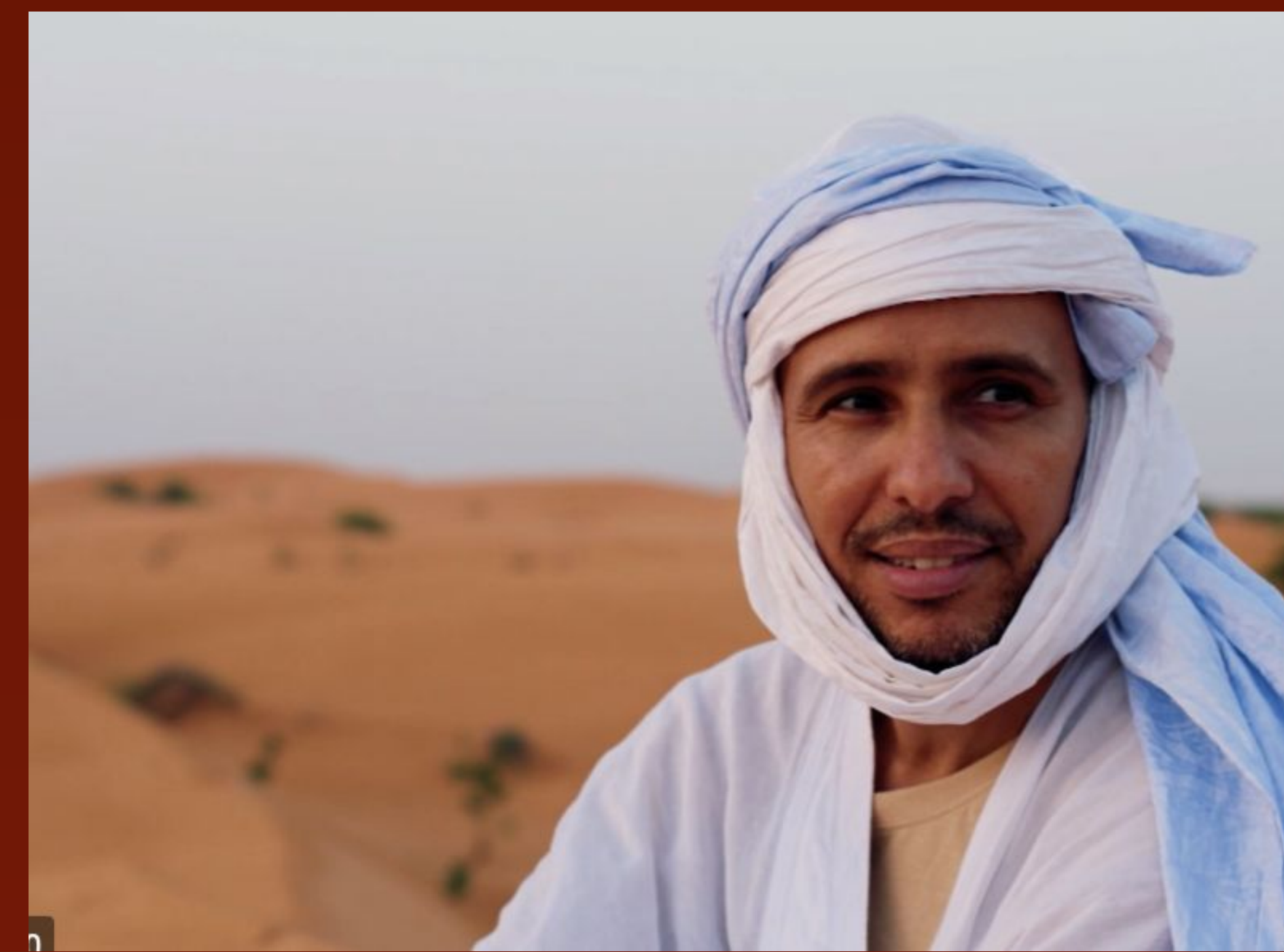
Photograph of Mohamedou Ould Slahi