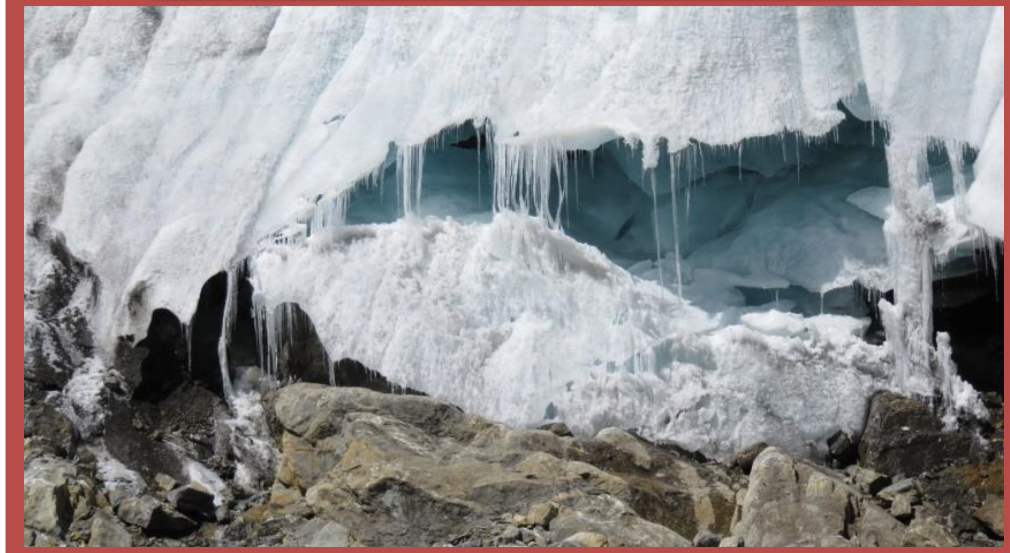
These blocks detached from the glacier due to melting caused by higher temperatures

Beyond these maximum safety dimensions of Lake Palcacocha, the neighboring village cannot be properly protected from floods.