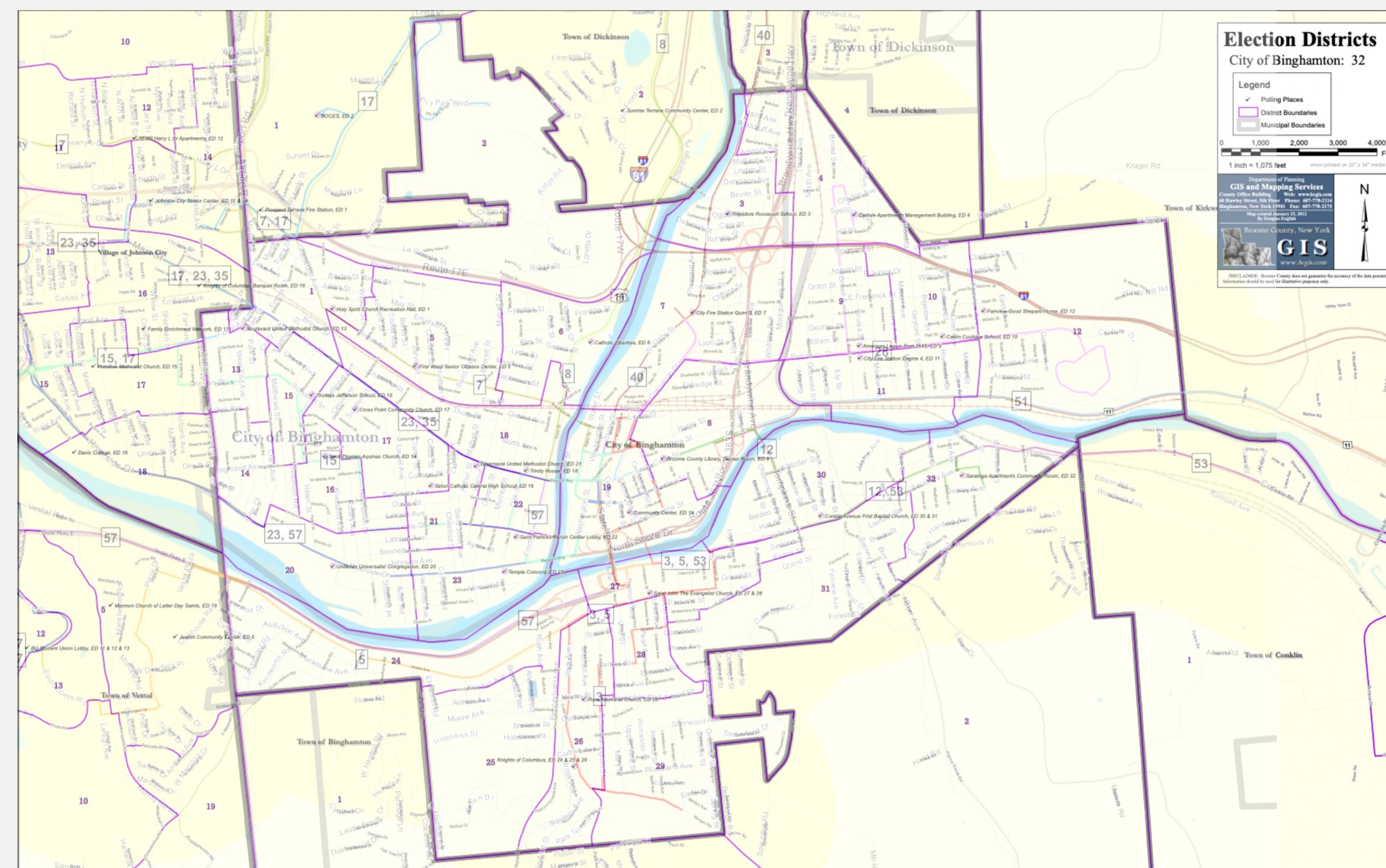
Fig. 2 Polling Locations and Fixed Transit Map

Within the City of Binghamton, a majority of the polling locations are within walking distance of transit lines. However, not all of the polling places appear to have ample parking locations for voters when lines build up. This creates a burden for voters that would decrease voter turnout.