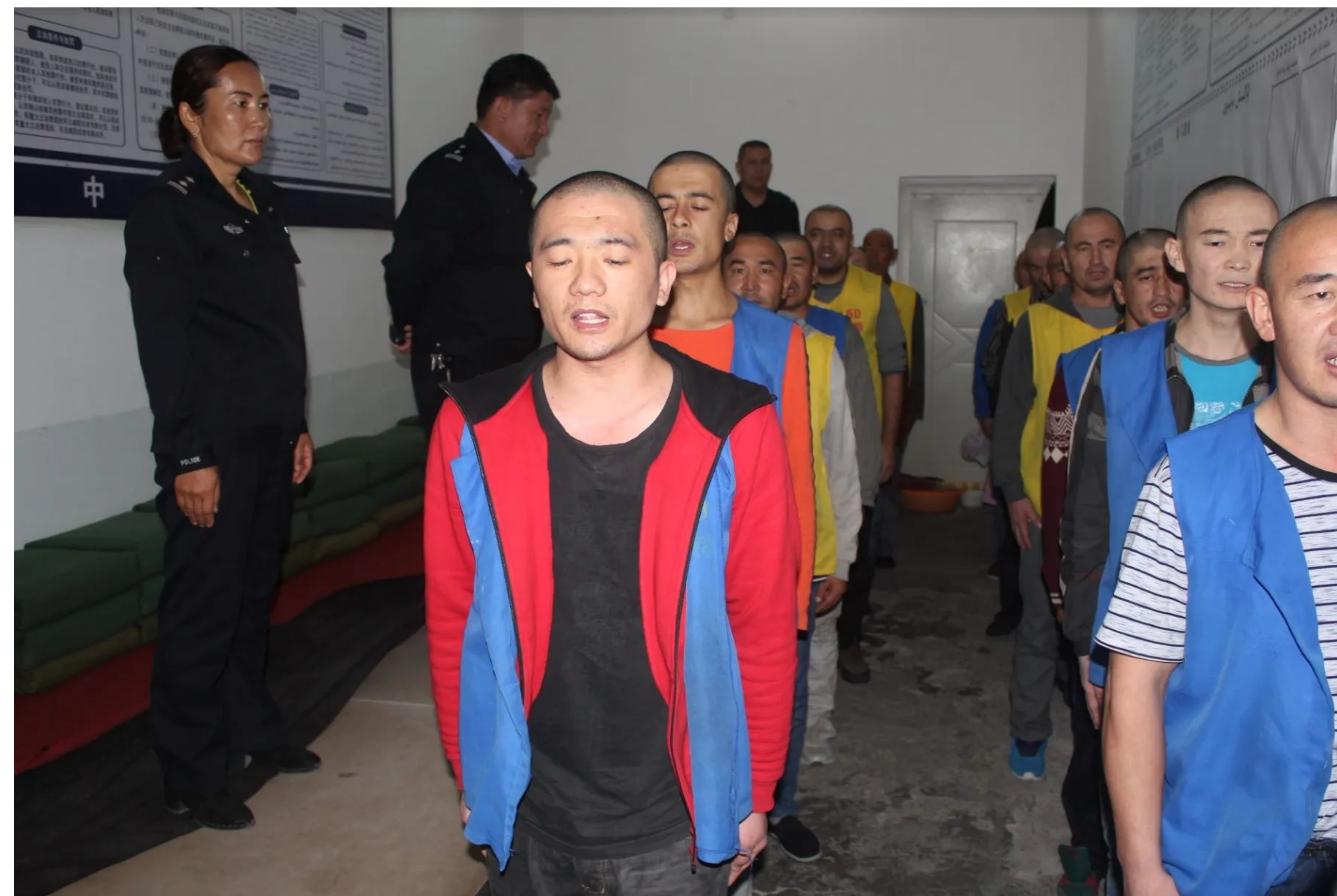
The image above depicts Uyghurs in a detention center.