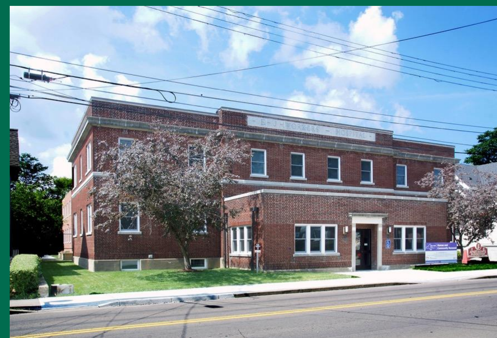
E.J Apartments for Seniors