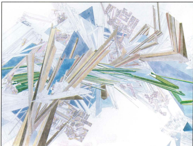
Sequence 12, View 12 (2004), 55" x 72", watercolor and graphite on paper

My drawings are based on complex geo-political situations. I work in a CAD environment combining various texts, maps, architecture and objects that, to my understanding, all contribute to the reality of a particular time and place. I use the tools of the program in non-traditional ways to sculpt all of this data virtually, creating a new form that is an amalgam of the contributing factors. I'll then create a series of drawings on paper from different stages and viewpoints of this virtual model. The final pieces contain only small, scattered clues as to the nature of their origin.