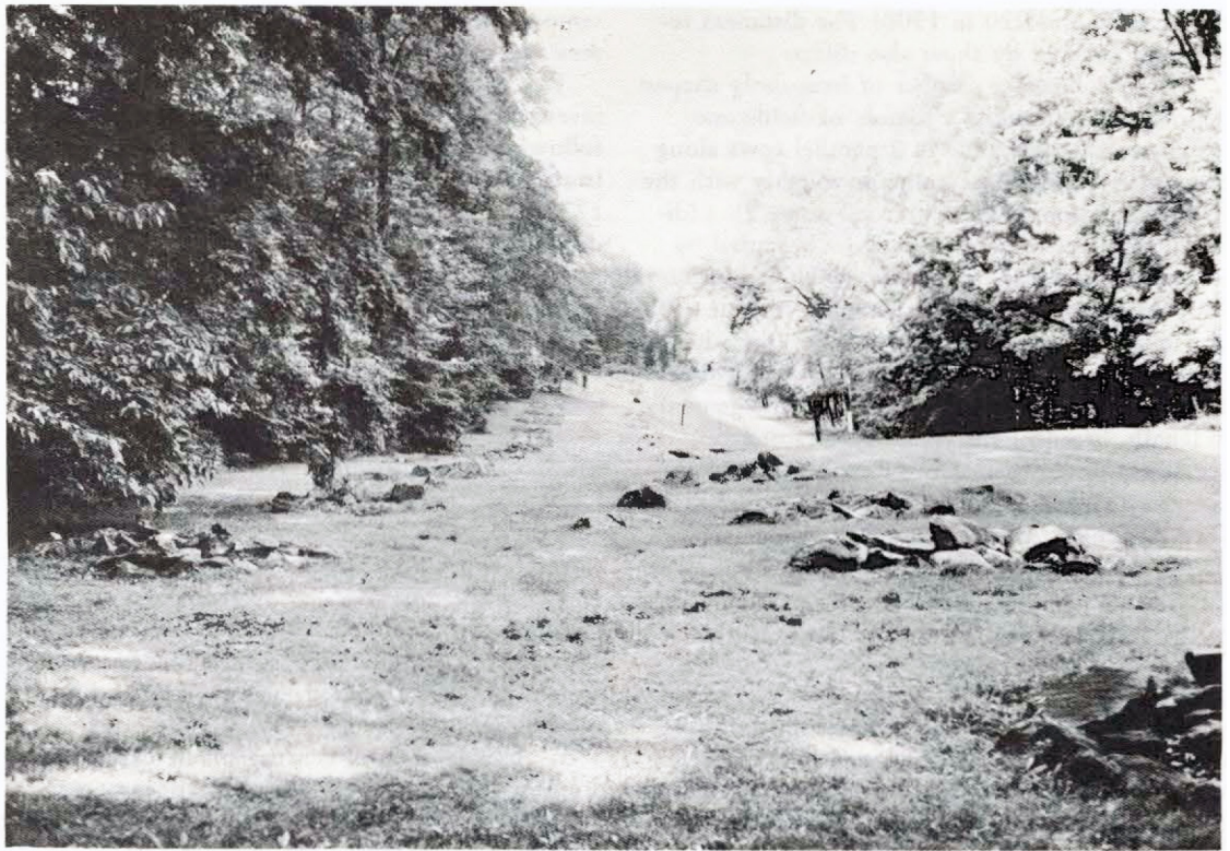
Figure 3. View looking north of Revolutionary War "hut fireplace."

Left 11 and PA:FP-Left 12). There was no visible modern soil disturbance and these features appeared unchanged from a 1903 photograph (Anonymous 1903). These features are collapsed Revolutionary War hut fireplaces similar to the other fireplace features located in 1973. In general the outer periphery of stones tends to approach a circular outline varying in (maximum) diameter from 2.0-3.5 meters with the feature's interior being a jumble of irregular native fieldstones (See Appendix A note 7).