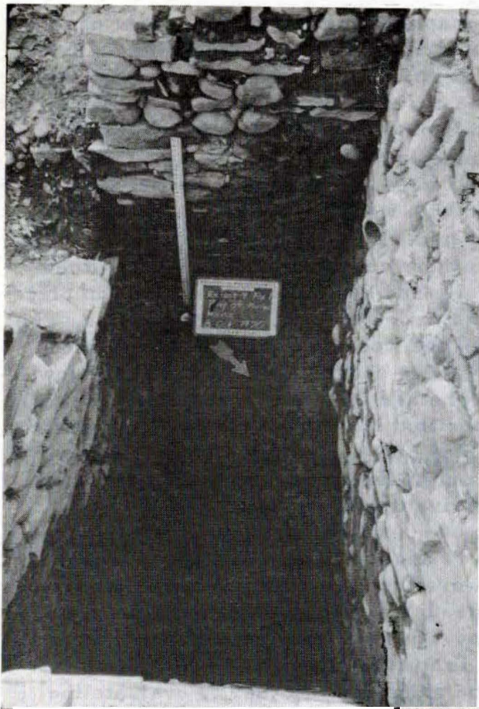
Figure 2: Privy 1, showing stonework. Note intrusive ca. 1908 pipe in the wall to the right.