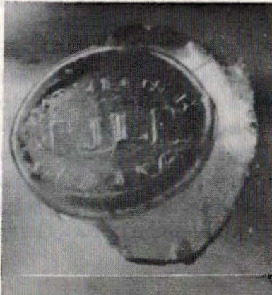
Figure 3: Bottle seal with the initials of James Lynch, made at the Mt. Vernon (N.Y.) Glass Co. from the fill between privies 71 and 77. Green glass; width: 37mm. (1 7/16").

served was built ca. 1828 (Wager 1896:52) and was torn down in 1971. The artifacts indicate that the privy was used until at least 1885 and probably until ca. 1890. The upper 3 feet were disturbed ca. 1908 for a drainpipe (Waite 1972:17) and in recent years by a gas line but the sterile zone protected the lower deposit. The owners, Wheeler Barnes and Alva Mudge, were well-to-do and could be considered upper class for a town the size of Rome.