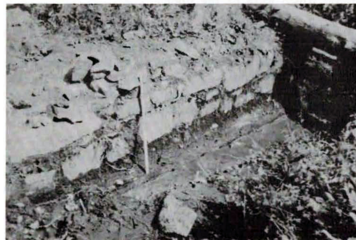
FIGURE 4. South race-way of Middle Forge with stone-lined side walls and remains of oak beams in the bottom.