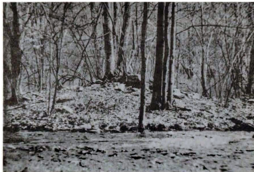
FIGURE 2. Site of Charlotteburg Middle Forge before excavation. Note remains of forge hearth in center.

The construction and dimensions of the two race-ways were determined by actual excavation. The side walls were of carefully laid cut stone and the bottom of heavy wooden planking (Figure 4). This, along with 9 inch by 9 inch "tie-pieces" along the bottom sides, were still intact and well preserved by the high water table.