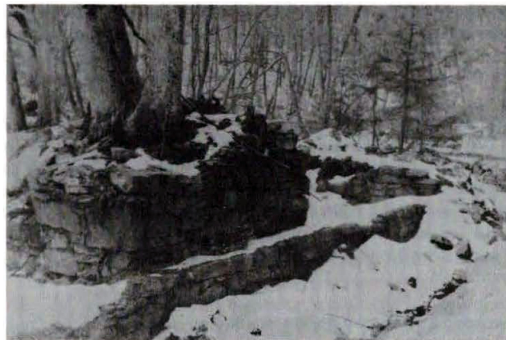
FIGURE 3. Remains of excavated forge hearth.

A dam abutment on the south side of the river was clearly visible. Projecting a straight line across the river, we found that it passed through a long series of cut stones lying in a straight line. This would seem to define the line of the original dam site and would bring the dam location to 14 to 15 feet of the west wall of the forge building. The site of this forge lay in a deep ravine and although the dam abutment on the south side of the river was still evident, there was no indication of the location of the abutment on the forge side of the river.