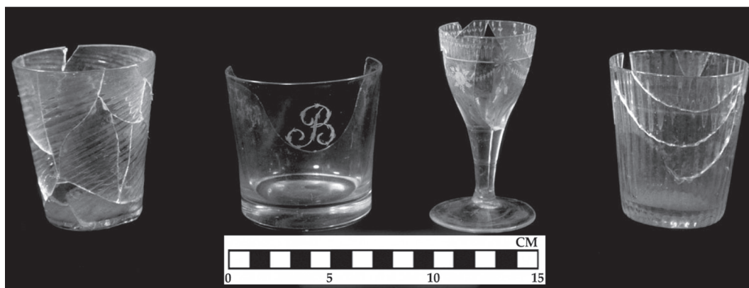
Figure 5. Glass drinking vessels from the Boardman privy, including an assortment of tumblers, one monogrammed with Boardman's initial, and a small stemmed wine or cordial glass.