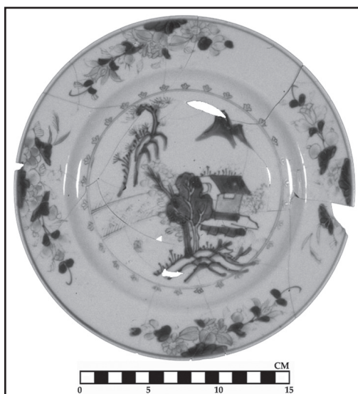
Figure 1. This Chinese Imari porcelain plate, recovered from an early 19th-century privy deposit at the Spencer-Peirce-Little site, is the quality of tableware one would have expected the Tracys to have owned. The plate and a Batavia-porcelain tea bowl are unique finds predating the other tea- and tablewares in this deposit by several decades, but cannot be directly linked to the Tracy occupation of the site.

Tracy's probate inventory, recorded on 30 September 1796, provides no details of ceramic, glass, or metal vessels associated with food preparation or serving (Essex County Registry of Probate 1796). Table 3 extracts from the full probate inventory only the entries listing items of material culture associated