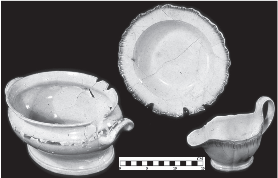
Figure 3. Green shell-edged pearlware soup tureen, large serving dish, and sauceboat from the Boardman privy deposit.

On the other hand, the glassware was not only of good quality, one set of wine stems and another set of tumblers were monogrammed with the letter B (FIG. 5), as was the Boardmans' silver teapot that survives in the collections of the Historical Society of Old Newbury (Beaudry 2008: 189). There is no evidence of elaborate preparation of banquet dishes. Rather, one gets the impression of good, hearty New England fare served in a congenial atmosphere without ostentation. The meals seem to have consisted of an abundance of daily fare, rather than fancy special dishes requiring culinary expertise over and above turning a spit and steaming or baking puddings. Boardman, despite having visited France during the American Revolution, seems to have eschewed the fancy French cuisine and elaborate preparations that the Tracys' cook or cooks attempted. Boardman and his family in the decades following the formation of the new republic seem instead to have become firmly attached to the sort of fare that characterized